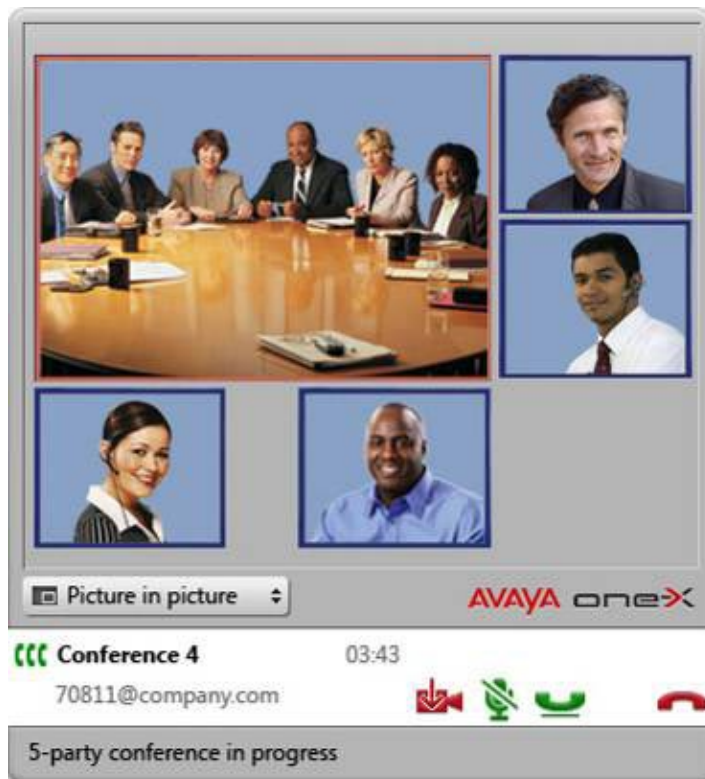
An example of a video communication linking geographically dispersed team using Avaya one-X

For Avaya, the traditional PBX has evolved into a sophisticated communications management platform that supports a wide range of devices — desk phones, wireless handsets, PC-based softphones, video phones that link easily to group video systems. The Avaya